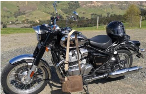
Phil Playford bought the Classic 650 from Royale in July 2025 He was suckered in by all the flashy chrome, but it has not stopped him ordering a Bear 650 in boardwalk white and hopes it will be delivered any day now.