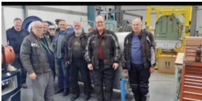
Wessex boys among the Spitfire jigs

“THE GUN” is the official magazine of The Royal Enfield Owners Club. published bi-monthly and distributed to paid up members. It must not to be reproduced in any way without the consent of the Editor. Views herein are not necessarily those of the Editor or of the Committee. The Club makes no representation as to the content, the accuracy or viability of advertisements nor the commercial articles, nor for the offerings of third parties.