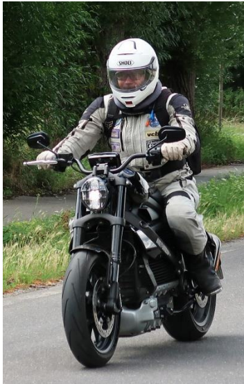
Harley-Davidson LiveWire (photo courtesy of Olaf Biethan).

One would expect these models to be replaced by other models with an ICE or electric engine. This is not the case. The electric motorcycles we see are almost all from manufacturers like Zero , Evoke , Damon , and Energica , that made electric motorcycles from the beginning. Other new manufacturers like OX Riders , Cake and Pursang have just started to produce or show interesting prototypes. Cake even advertises its model Ösa+ as “... a utility machine, a work bench and power station on wheels”. We do not hear much from the established brands. Of course, Harley-Davidson has its Livewire, KTM some dirt bikes, Triumph recently showed their TE-1 project prototype, and BMW has its C evolution scooter. However, all this cannot be