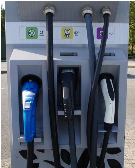
Charging station.